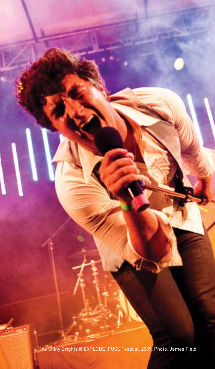
The Shiny Brights @ EXPL0DE! FUSE Festival, 2009.