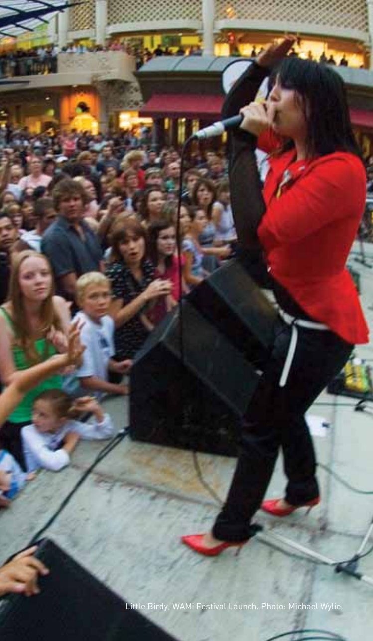
Little Birdy, WAMi Festival Launch.