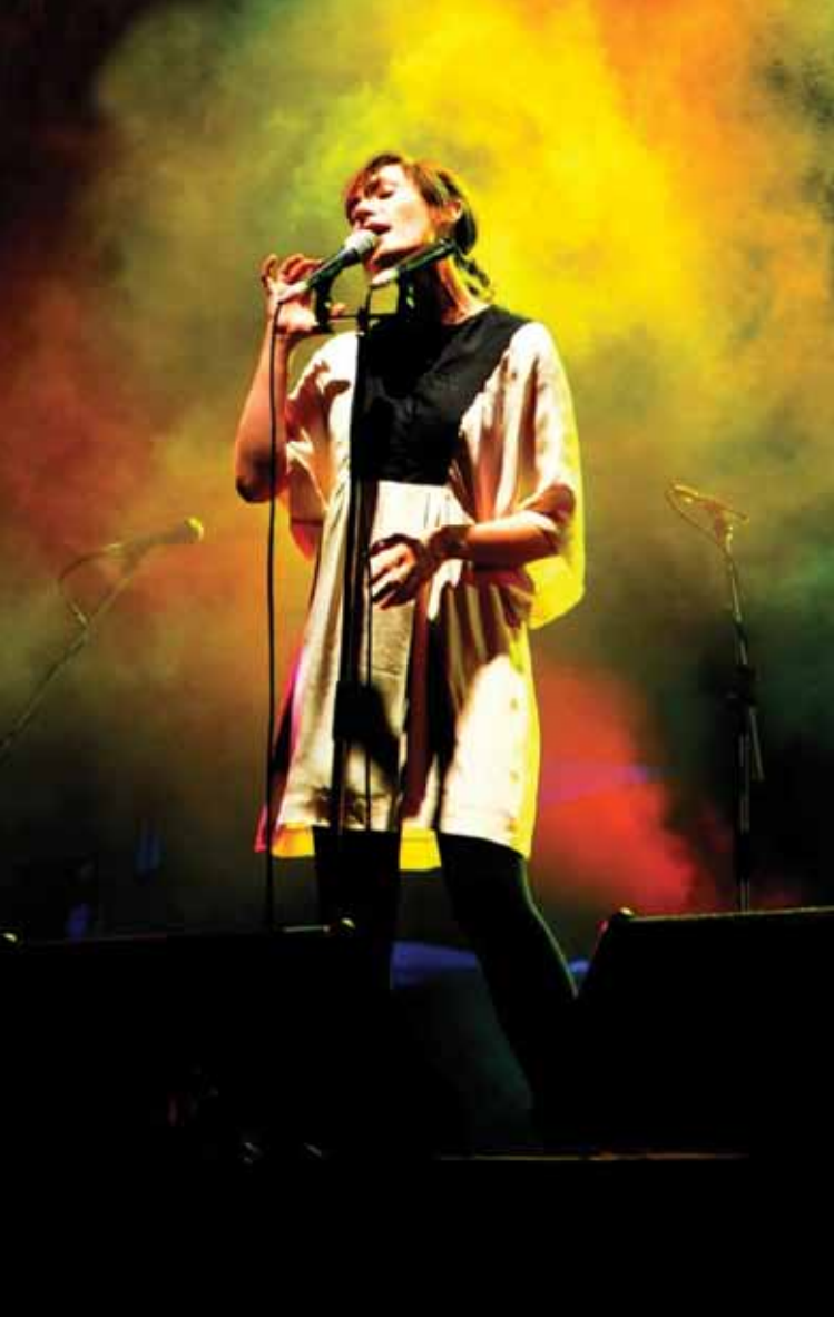
Sarah Blasko, One Movement for Music, Perth.