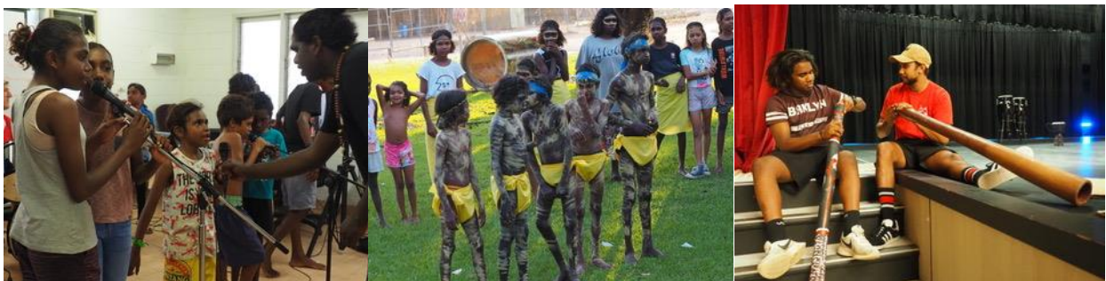
Beats of Culture Music (BoC Music), The Youth Mill Pty Ltd

The ILA program includes annual operational funding support to a network of 21 Indigenous Language Centres across the country working on capturing, preserving and maintaining over 150 Aboriginal and Torres Strait Islander languages. The ILA program also supports Aboriginal and Torres Strait Islander peoples to develop, produce, present, exhibit or perform Indigenous arts projects that showcase Australia's traditional and contemporary Indigenous cultural and artistic expressions.