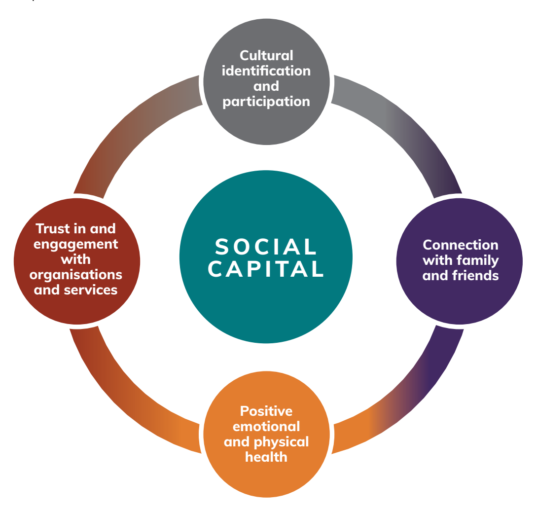
Figure 2.3: Social capital formation

This has associated positive social gains such as reduced needs for health and welfare support.<sup>108</sup> By contrast, loss of language, and loss of social connectedness through language, has long been articulated as a source of grief for Aboriginal and Torres Strait Islander people.<sup>109</sup> On a community level, the social benefits of learning traditional language may include healing and enhanced family and community functionality. Thus, investment in language and culture is a sound approach for realising a range of social benefits.