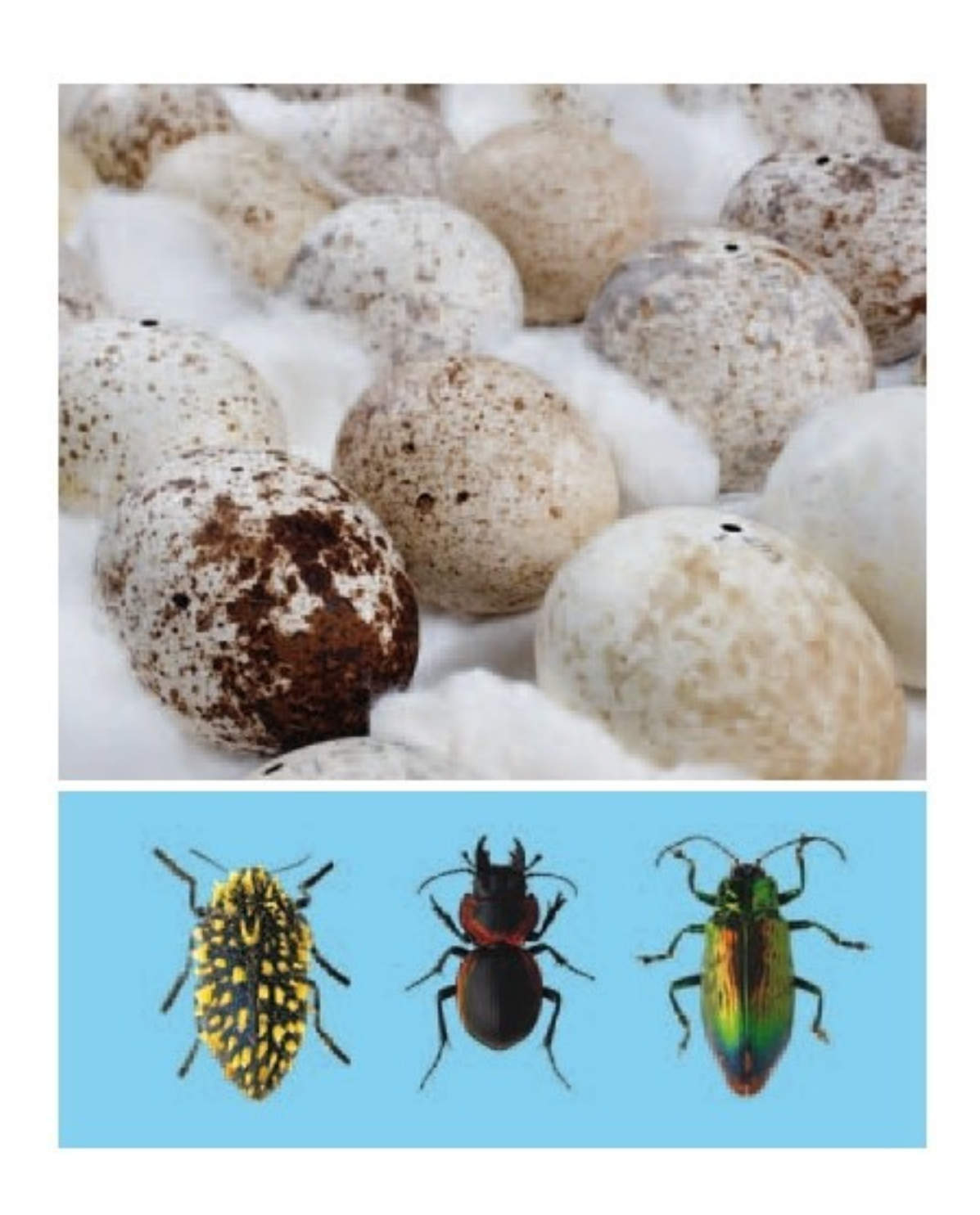
Oological collection donated to the CSIRO Beetle collection donated to the Tasmanian Museum and Art Gallery