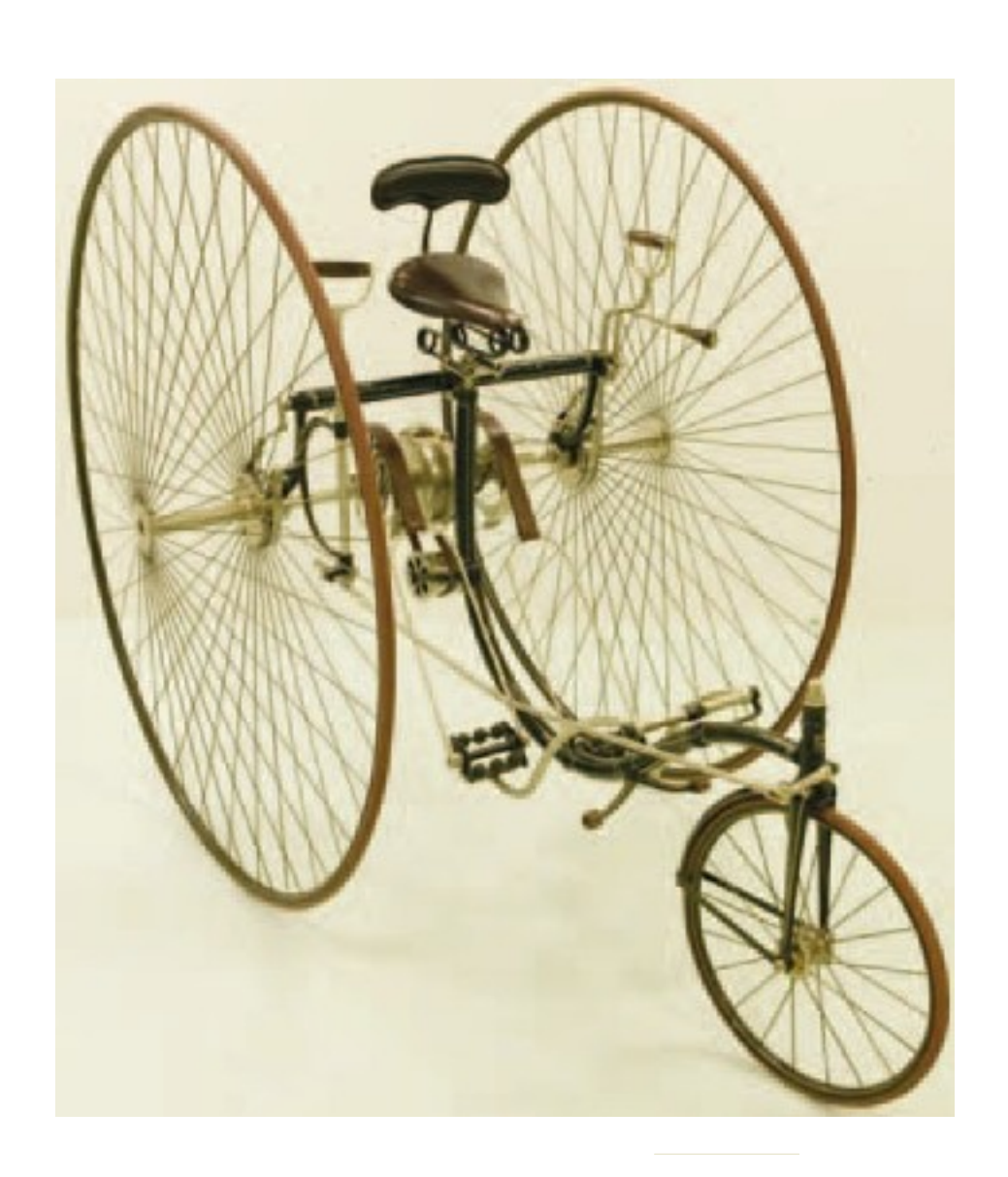
Treadle powered omnicycle 1870s-80s, donated to Museum Victoria