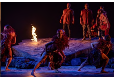
Bangarra's Wudjang: Not the Past