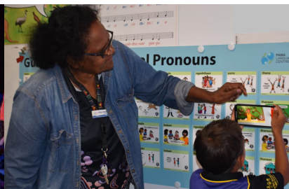
Guugu Yimithirr teacher and student using augmented reality poster