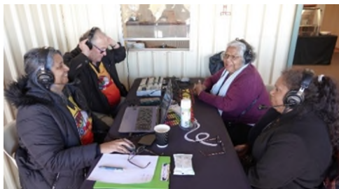
Talking about language on the airwaves with Radio MAMA

The program includes annual operational funding support to a network of 24 Indigenous Language Centres throughout the country working on conserving, revitalising and sustaining Indigenous languages. The program also supports Aboriginal and Torres Strait Islander peoples to create, promote and celebrate Indigenous cultural expression.