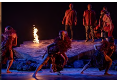
Bangarra's Wudjang: Not the Past