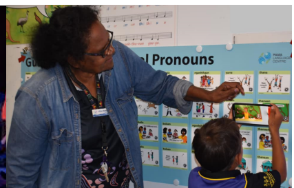
Guugu Yimithirr teacher and student using augmented reality poster