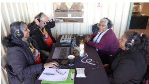
Talking about language on the airwaves with Radio MAMA

The program includes annual operational funding support to a network of 24 Indigenous Language Centres throughout the country working on preserving, revitalising and sustaining Indigenous languages. The program also supports Aboriginal and Torres Strait Islander peoples to create, promote and celebrate Indigenous cultural expression.